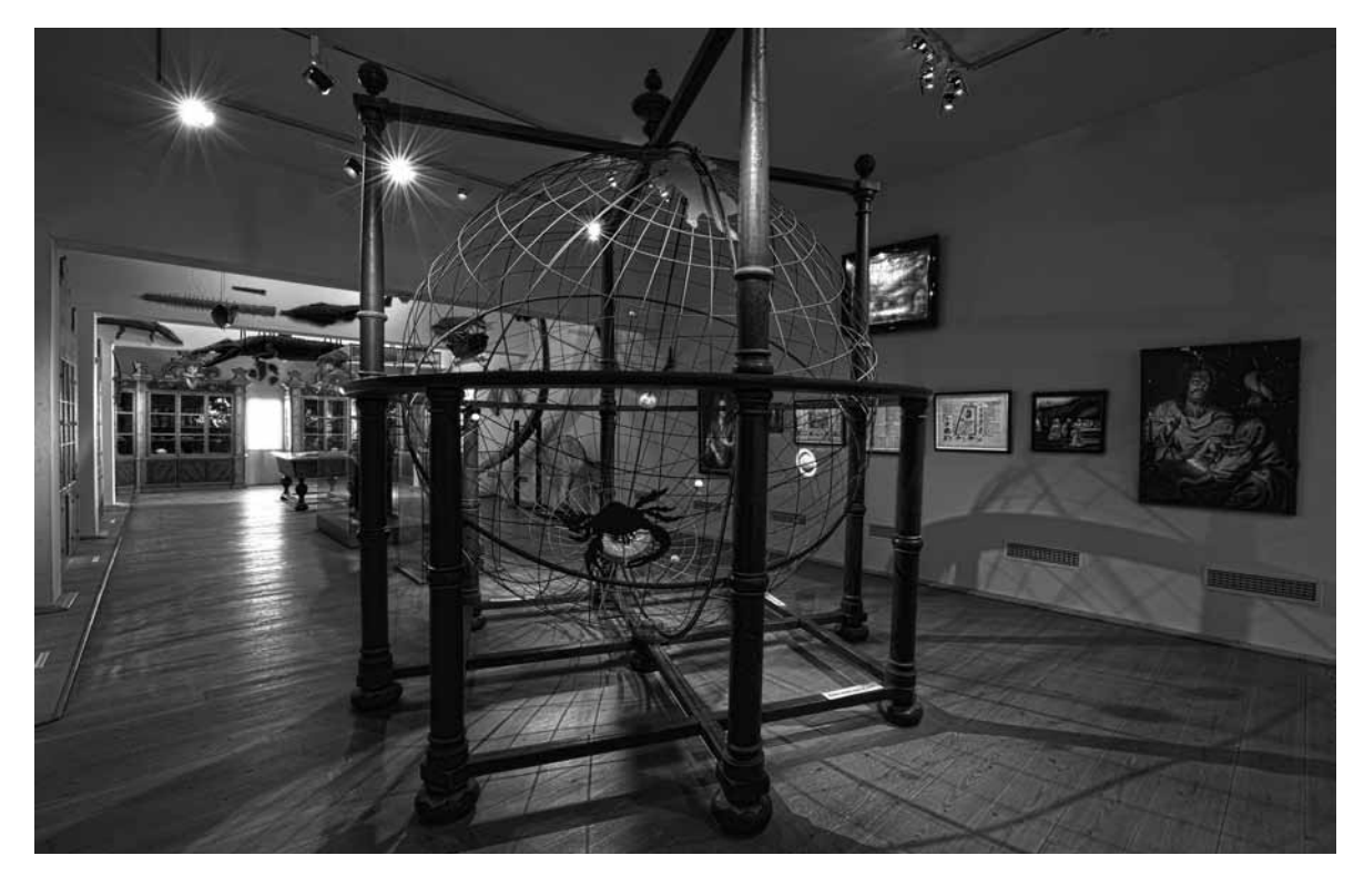
Fig. 4. The Cabinet of Artefacts and Natural Curiosities at the Historic Orphanage in Halle.

He wanted to delight the director with uplifting news but did not have many, as he wrote in January 1737. Instead, he began to "record miscellaneous events secundum temporis seriem" in order to send these "from time to time" to the Halle he esteemed so much.<sup>8</sup> Thus, a lack of pious success reports about progress in building the Kingdom of God did not lead to a cessation of recording and reporting; instead, viewing and documenting the world's diversity moved more strongly into the center of his attention.