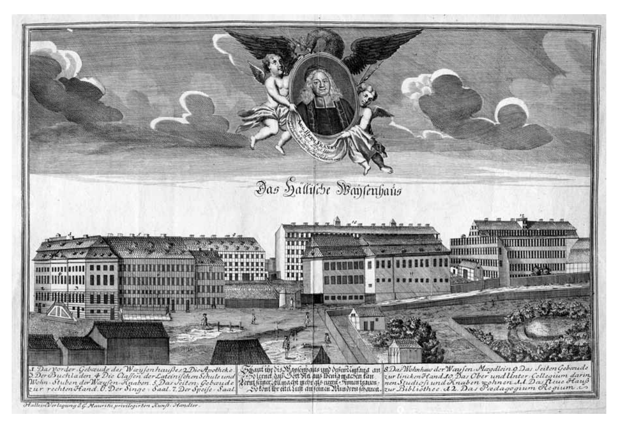
Fig. 1. The Francke Foundations ("school town"), general view from the south at around 1740 (Johann Georg Mauritius, Das Hällische Waysenhaus, 1740, copperplate engraving, 26,5 × 41 cm, Franckesche Stiftungen, Halle, AFSt/B Sd 0091)

From the 1690s on, August Hermann Francke (1663–1727) laboured in Halle to reform and improve the world. He regarded his work as a contribution to building the Kingdom of God on earth. His goal was a renewal of the living together of human beings in a Protestant-Pietist sense, applied not only in Germany and Europe but in the world as a whole. His work was based on two premises: individuals should find true devotion to God independent of official church institutions ("piety of the heart"); they should strive to change and improve life on earth in concrete ways by means of a comprehensive education and the advancement of talents ("ingenia"). These were the basic tenets of Halle Pietism. From 1695 on Francke founded an orphanage in Halle as well as schools for pupils from all estates of early modern society — both orphans and children from noble families, both boys and girls — in which theology students from the University of Halle worked as teachers (Fig. 1).